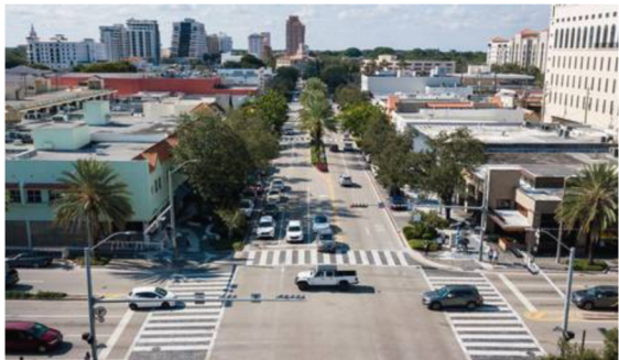
Fifteen businesses opened on Miracle Mile, pictured above, since 2019. More are coming.